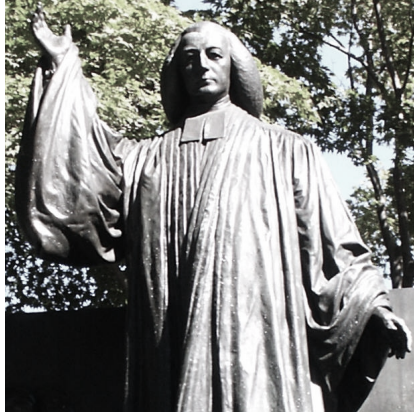
Henry Melchior Muhlenberg